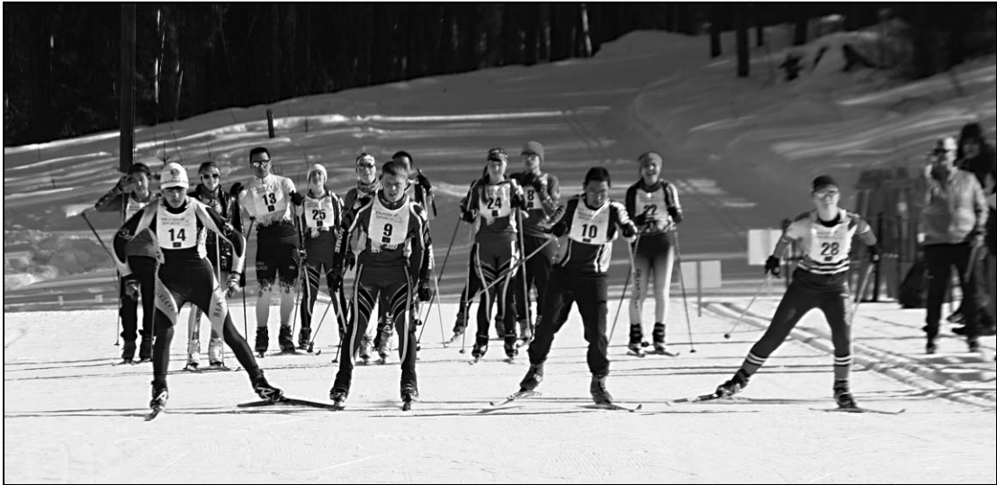
BOYS RACE— Competitors in the High School Boy’s race leave the starting line during the 10-kilometer event.